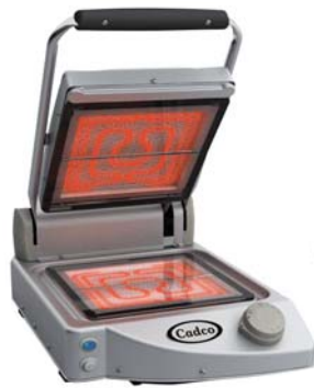
CPG-10FC(120 & 220)